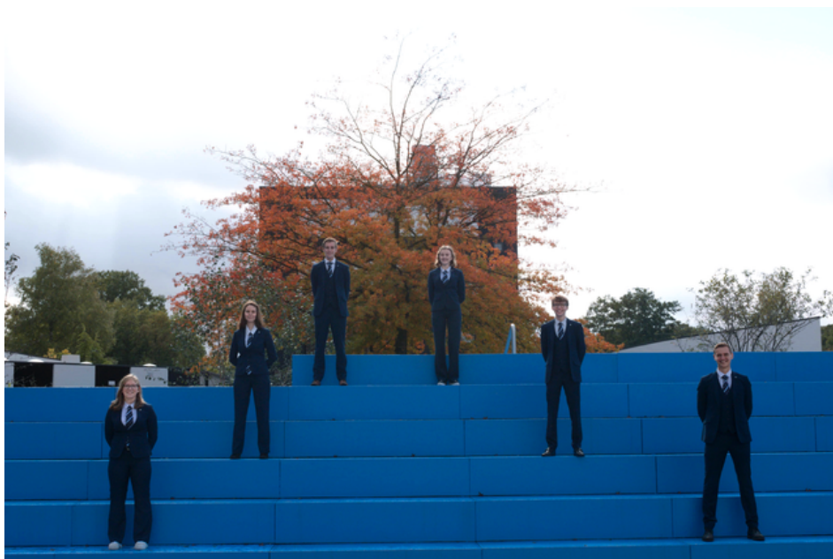
The UC Twente Board

The goal of the buddy program is to improve our relationships with other University Colleges. We believe that a collaboration with UCT will be very beneficial since we are both UC's who have the disadvantage of being further away than the other UC's. At the same time UCT has grown a lot in a small amount of time, meaning that they can perhaps teach us a thing or two. We are both very excited about working together and are looking forward to seeing where this collaboration will go. Make sure to keep an eye on our website since we are already working on our first (online) collaborative event!